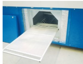
Changeable air filter