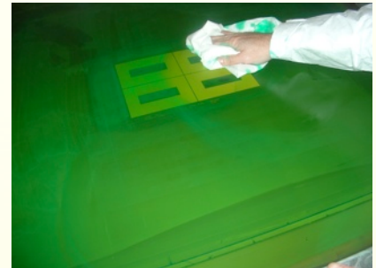
Step 3. Use rags or towels to wipe up ink residue. Re-apply to clean up ink residue in image area.