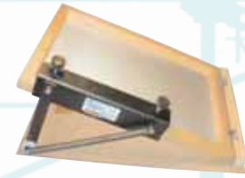
Heavy Duty Reversible Side Kick ( included )