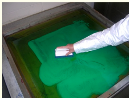
Step 2. Scrub ink with a non-absorbent pad until liquified.