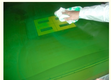
Step 3. Use rags or towels to wipe up ink residue. Re-apply to clean up ink residue in image area.