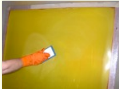
2. Scrub screen with non-abrasive pad or brush.