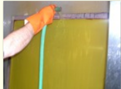
3. Flood rinse the screen starting at the top and washing all residue off the screen.