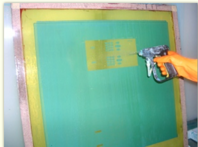
1)After removal of ink, block-out, and tape, apply CDR to a wet screen(both sides).

Emulsions, that are not properly broken down, will leave excessive residue on the mesh.