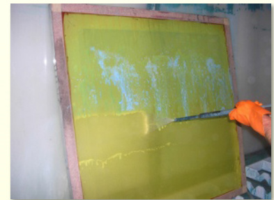
Step 3. High pressure rinse - starting at bottom.