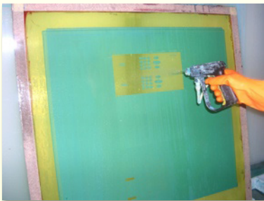
Step 1. After removal of ink, block-out, and tape, apply GEMZYME to a wet screen(both sides).

GEMZYME can be used in concentrated form, or it can be diluted up to 1 to 20 parts of water.