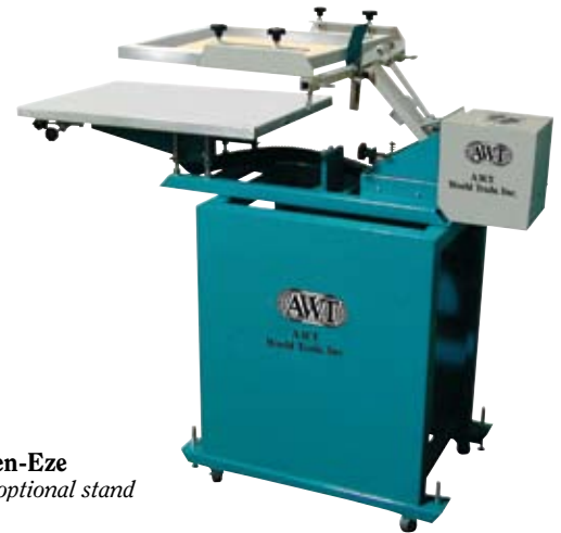
Screen-Eze Shown with optional stand