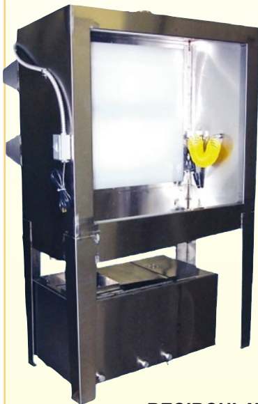
4 x 4 Stainless Steel Recirculating Booth Click here for more details.

Always card excessive ink from screen. Use one of the following applications.