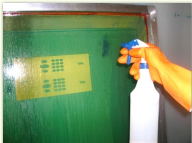
1. Spray GR 6v on both sides of screen.