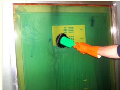
2. Scrub screen with non-abrasive pad or brush.