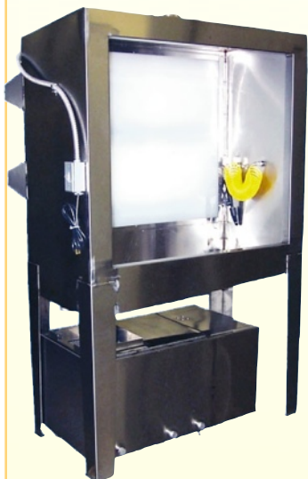
4 x 4 Stainless Steel Recirculating Booth

Always card excessive ink from screen. Use one of the following applications.