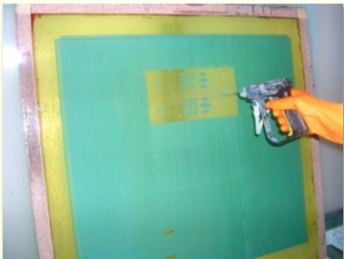
Step 1. After removal of ink, block-out, and tape, apply ER/80 to a wet screen(both sides).

ER/80 can be used in concentrated form, or it can be diluted up to 1 to 30 parts of water. ER/80 can be applied by a sponge, pad, spray bottle, dip tank, or pneumatic pump systems.