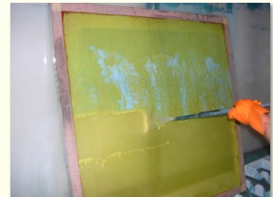
Step 3. High pressure rinse - starting at bottom.

E.R.S. - Series Emulsion Reclaiming System Click for more details.